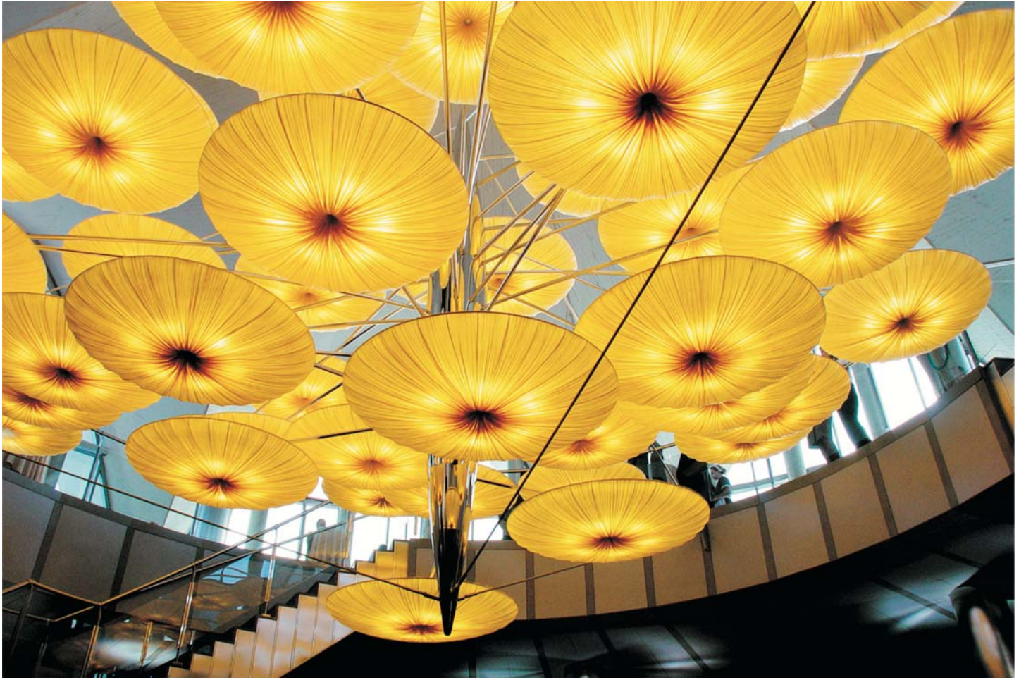
Stand By (Gold)