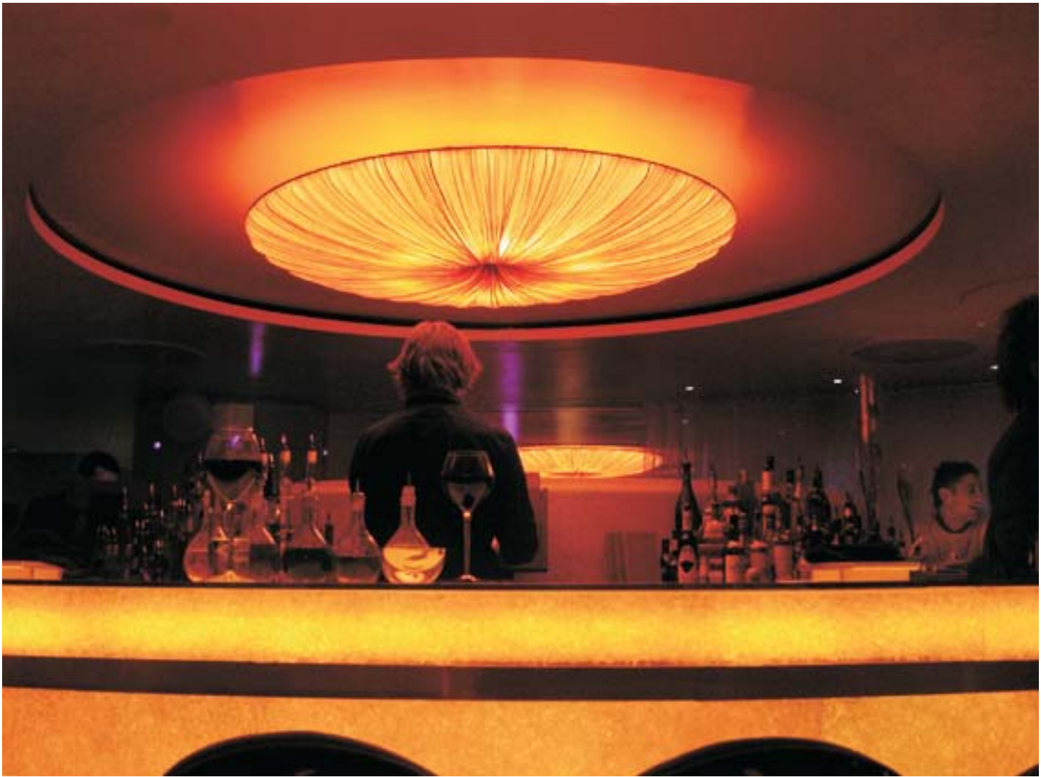
Stand By (Flame) @ Coocon Bar, London 2004