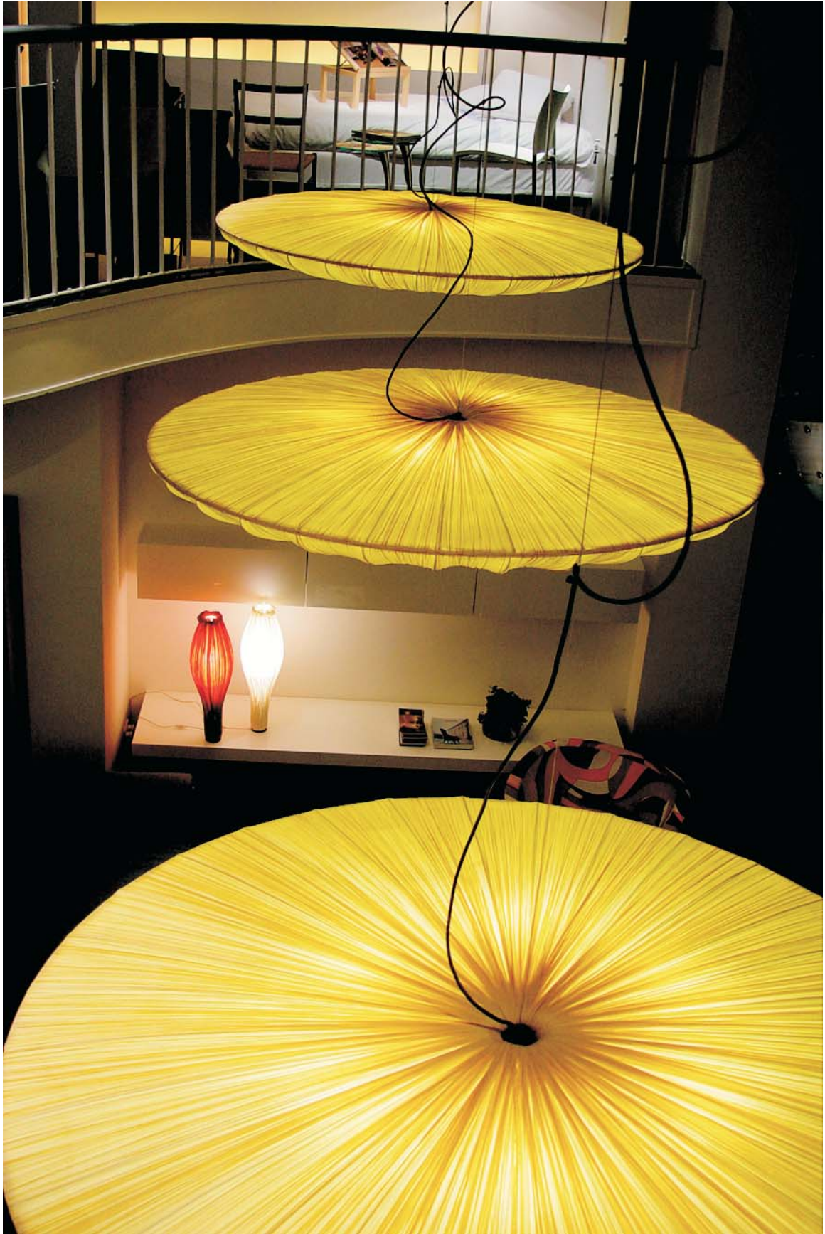
Stand By (Gold)