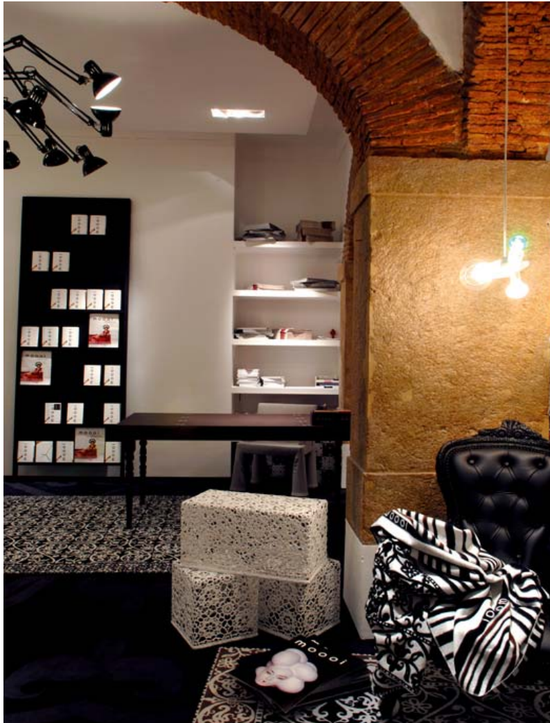
Moool Monobrand store, Lisbon.