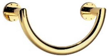
Argolla Towel ring 36.20.55.001