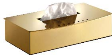
Caja kleenex Tissue box 36.94.01.001