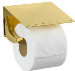
Portarrollos n°2 (usa) / derecho (right) Right paper holder n°2 36.40.02.001