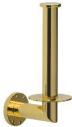
Portarrollos auxiliar n°1 Spare paper holder n°1 36.40.42.001