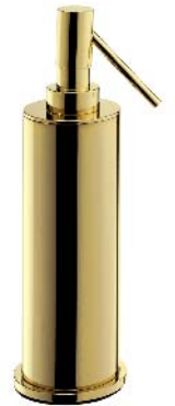
Dosificador sobremesa n°2 F/standing soap dispenser n°2 36.78.32.001