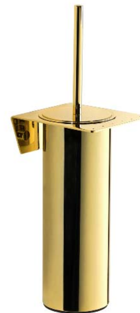
Escobillero pared Wall toilet brush holder 36.90.01.001