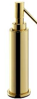
Dosificador sobremesa n°1 F/standing soap dispenser n°1 36.78.31.001