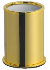
Portacepillos sobremesa F/standing toothbrush holder 36.70.50.001