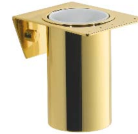
Portacepillos pared Wall toothbrush holder 36.70.01.001