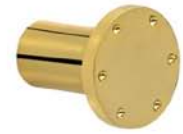
Colgador n° 1 Hook n°1 36.30.11.001