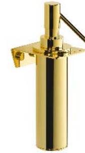
Dosificador pared Wall soap dispenser 36.78.01.001