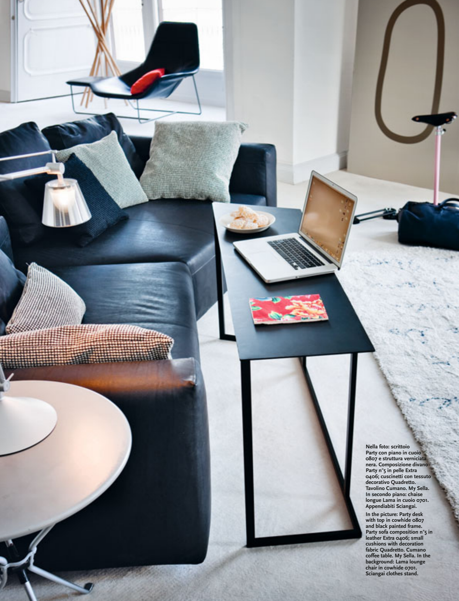
Nella foto: scrittoio Party con piano in cuoio o807 e struttura verniciata nera. Composizione divano Party n°5 in pelle Extra o406; cuscineti con tessuto decorativo Quadretto. Tavolino Cumano. My Sella. In secondo piano: chaise longue Lama in cuoio o701. Appendiabiti Sciangai. In the picture: Party desk with top in cowhide o807 and black painted frame. Party sofa composition n°5 in leather Extra o406; small cushions with decoration fabric Quadretto. Cumano coffee table. My Sella. In the background: Lama lounge chair in cowhide o701. Sciangai clothes stand.